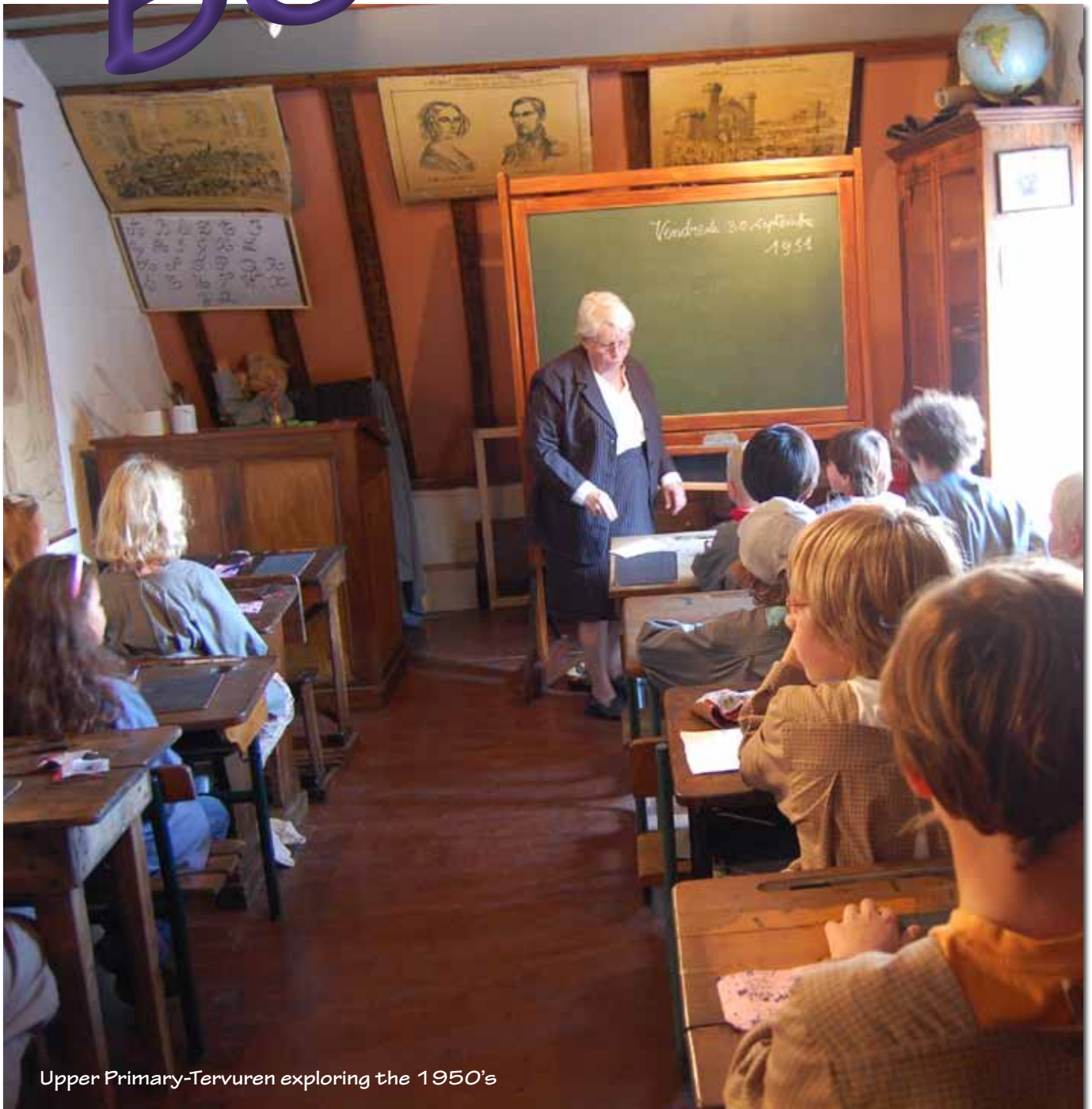
Upper Primary-Tervuren exploring the 1950's